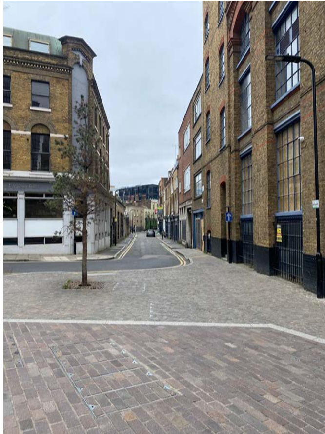
Clifton Street towards Holywell Row